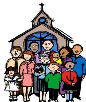
Our Church Family