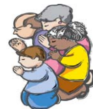
Please Pray For: